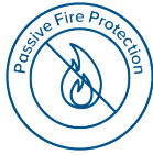
Passive Fire Protection