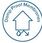
Damp Proof Membrane