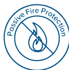
Passive Fire Protection