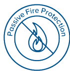
Passive Fire Protection