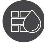
Damp Proof Membrane