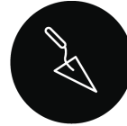
Damp Proof Course