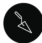
Damp Proof Course