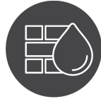
Damp Proof Membrane